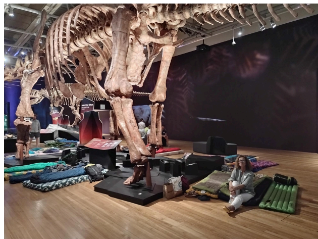
Whānau Day, 2023.

Roar & Snore offers a unique way to engage with prehistory. Tickets are limited, so book your spot now for the sleepover of a lifetime! Continental breakfast included.